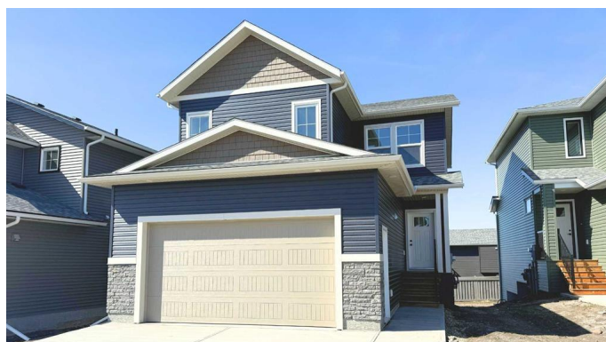
The REDMOND II 2,000 sq. ft.