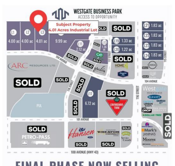
FINAL PHASE NOW SELLING