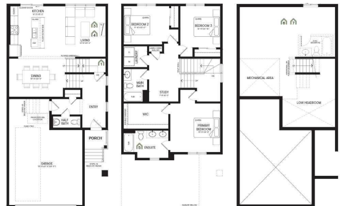
Main floor 707 sq ft.