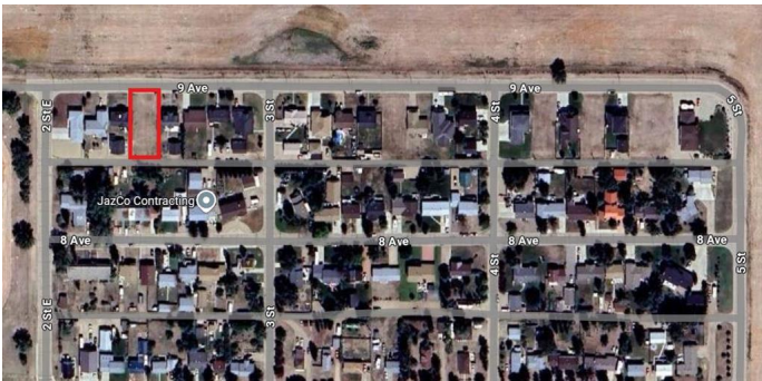
Town of Bassano Vacant Property Listing Details

BEAUTIFUL BASSANO - Welcome to an incredible opportunity to build your dream home in vibrant Bassano for only $5,000! This prime lot has all town services conveniently run to the property line, ready for your vision. Enjoy Bassano's charming community with an outdoor pool, local arena, parks, and a revitalized downtown. Buyers must submit a development permit application within 6 months of signing for a taxable improvement per LUB 921/21. There is also a build timeline requirement. Allowed property types include Prefab Homes and Stick Build. Mobile homes are NOT allowed. Call now to get more information as we have multiple lots available!