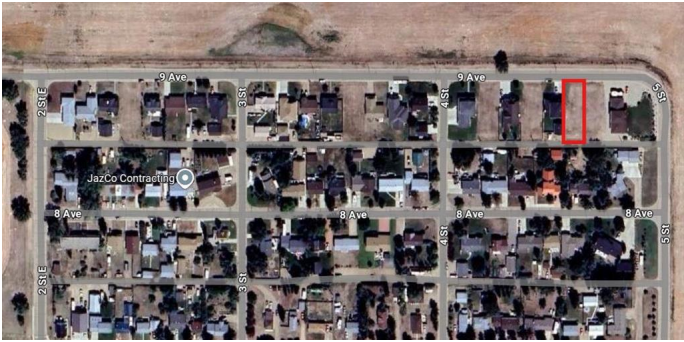
Town of Bassano Vacant Property Listing Details

BEAUTIFUL BASSANO - Welcome to an incredible opportunity to build your dream home in vibrant Bassano for only $5,000! This prime lot has all town services conveniently run to the property line, ready for your vision. Enjoy Bassano's charming community with an outdoor pool, local arena, parks, and a revitalized downtown. Buyers must submit a development permit application within 6 months of signing for a taxable improvement per LUB 921/21. There is also a build timeline requirement and minimum build size of 1400sqft with a front attached garage. Allowed property types include Prefab Homes and Stick Build. Mobile homes are NOT allowed. Call now to get more information as we have multiple lots available!