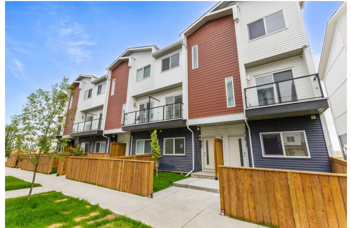
628 Red Sky Villas NE, Calgary, AB

Modern comfort, flexible living, and a convenient location—this move-in-ready home has it all. Book your showing today!